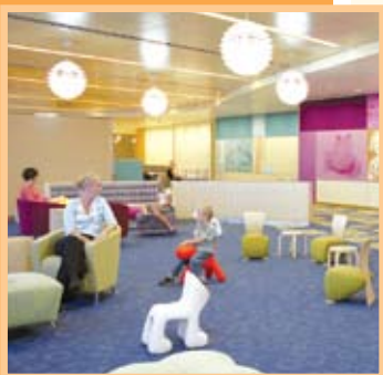
Outpatient Waiting Room