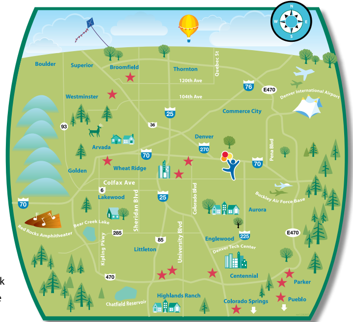
Children's has families covered from the southern plains of Pueblo to the flatirons of Boulder County and all across the Front Range.